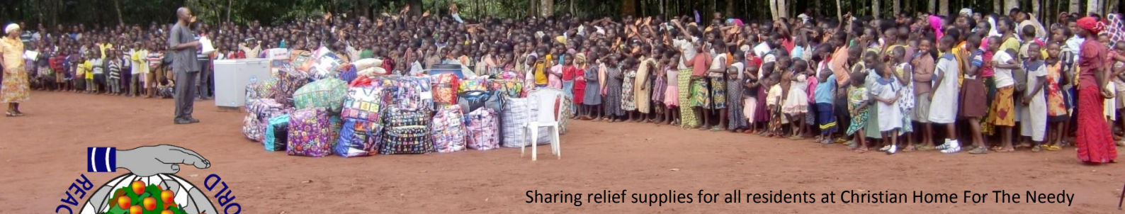
Sharing relief supplies for all residents at Christian Home For The Needy