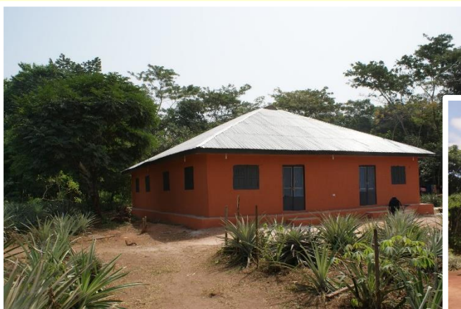
New houses for the girls