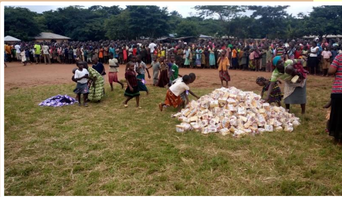
Giving out bread for all the children.

With great joy we also received about 300 children in January from the northwest of the country.