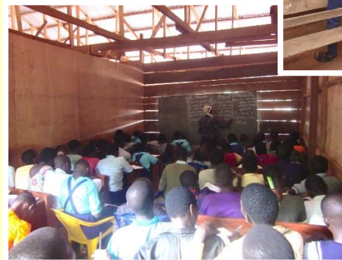
Congested class rooms

Still, there is also the urgent need here to have more accommodations as new children are arriving daily.