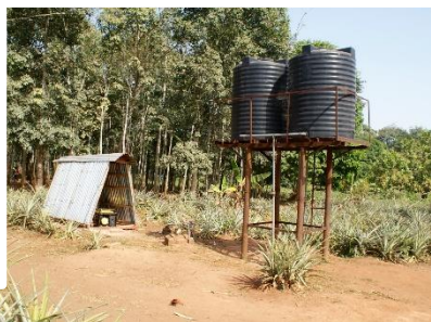
New water tanks