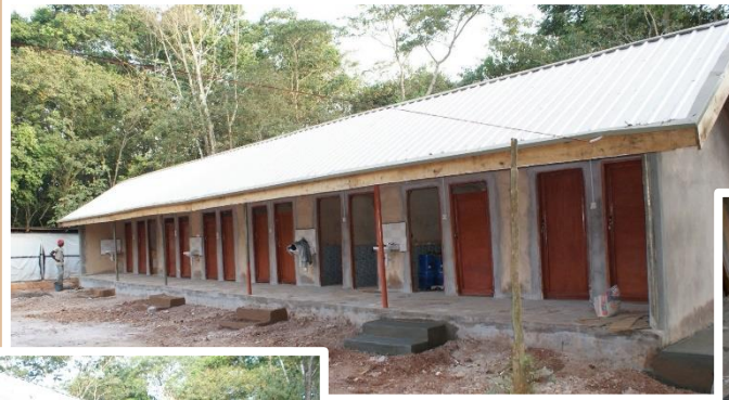
15 new toilets for the boys