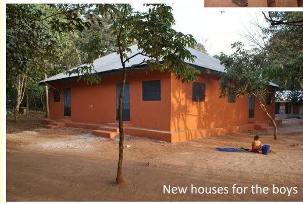
New houses for the boys