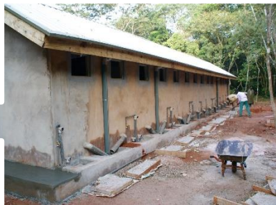
Toilets with water system