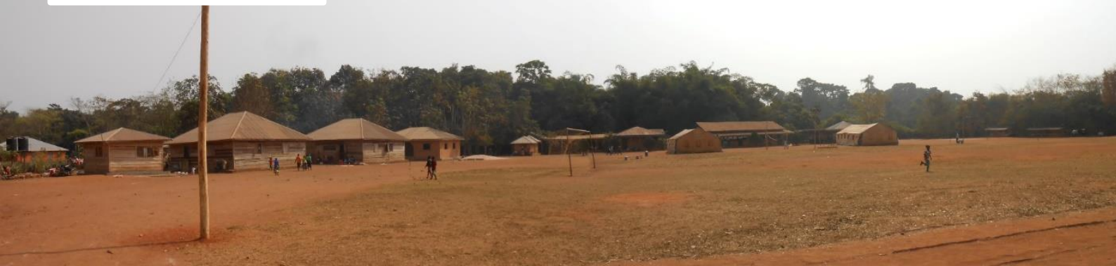
Panorama view of International Centre in Uhogua/Benin City

Further, a small wooden house each for the boys and the girls has been built, which are presently used as accommodations, but will later serve as facilities for barbing children's hair.