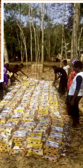
Donated eggs, bread and plantains