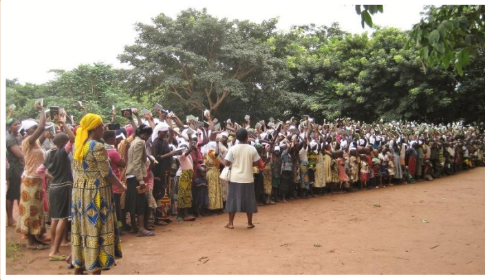
The children are happy about the donated new bibles.